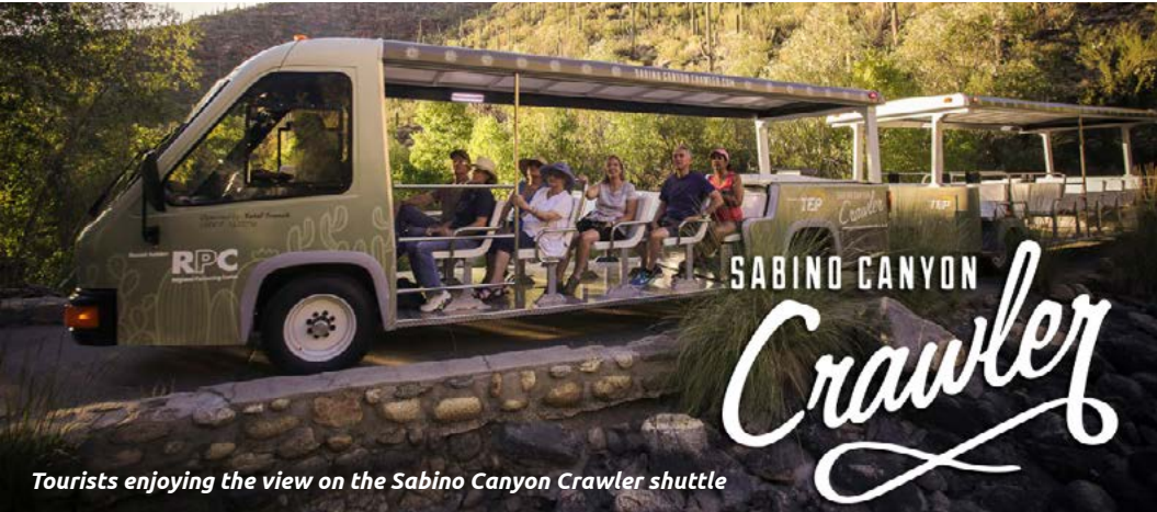
Tourists enjoying the view on the Sabino Canyon Crawler shuttle