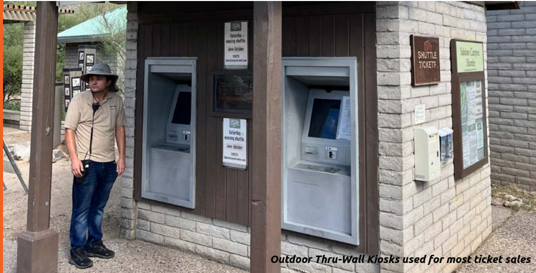
Outdoor Thru-Wall Kiosks used for most ticket sales

established the Sabino Canyon Crawler system in 2019. The RPC, a 501(c)(3), advances policies, practices and solutions to regional planning, environmental and energy challenges in Pima County through research and educational outreach. The Sabino Canyon Crawler replaced the previous diesel-operated shuttles, which were noisy, smelly, and created air pollution.