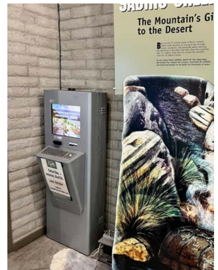
Transit kiosk located inside gift shop

After conducting a search process and receiving several bids, the RPC partnered with Concord, N.H.-based Advanced Kiosks .