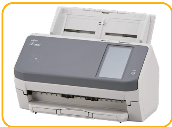
FULL SIZE DOCUMENT SCANNER Fujitsu fi-7300NX (Optional)

The Office Extension Lite comes fully integrated with: