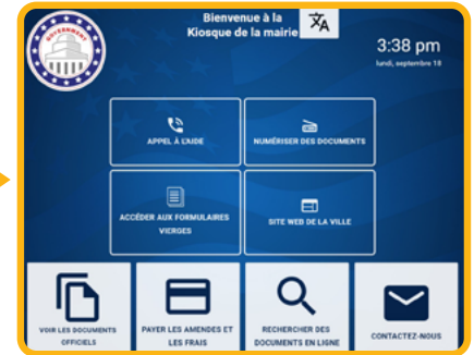
3. Configurable interface text is translated