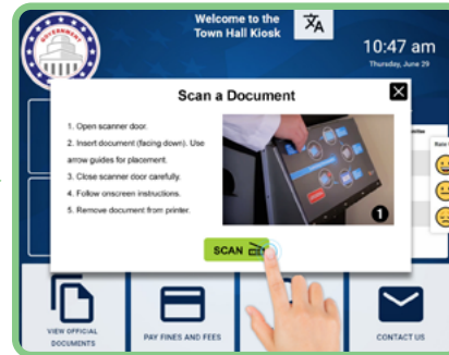
2. User follows onscreen scanning directions