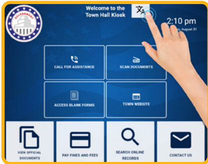
1. User taps translation button

Instantly transform all configurable text on the interface. Pick from over 100 languages!