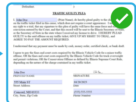
3. Completed form is delivered in original format