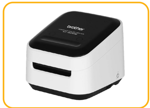
COLOR NAMETAG PRINTER Brother VC-500W (Optional)

Want to connect your Office Extension Lite to a different scanner or printer?