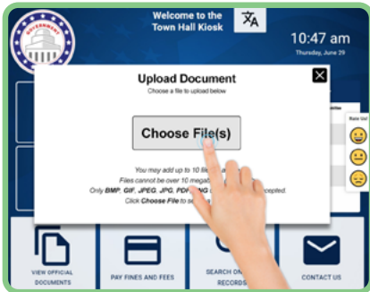
1. User taps upload button

Submitting documents just got a lot easier! Compatible with popular web-based enterprise software platforms.