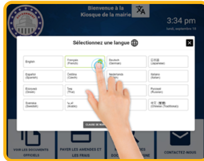
2. User locates & taps desired language