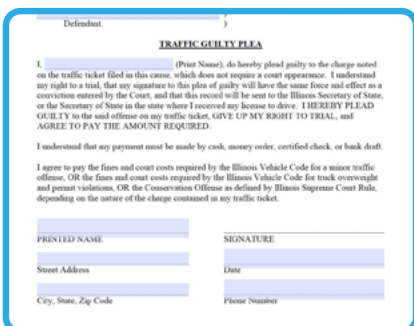
1. User begins with a blank form

Simplifying the form fill process for complex forms. Works with any form! See demo here