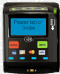
EMV CHIP READER