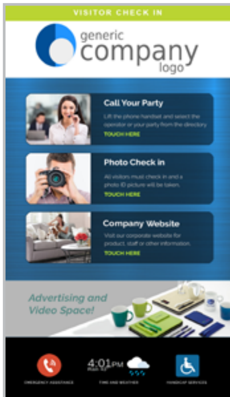
Lobby Welcome Template (Vertical)

The Zamok Homepage module is fully customizable to present users with buttons and links as desired. It also comes with industry and application specific templates to help launch your project. Screen savers, slide shows, and media libraries are all available features for customizing your kiosk to match your brand.