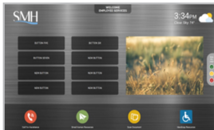
Lobby Welcome Template (Horizontal)

◀ Zamok prebuilt templates, colors, and themes to get your kiosk up and running! Every kiosk screen layout is customizable to fit your organization's branding and functional needs. Contact us for custom development options.