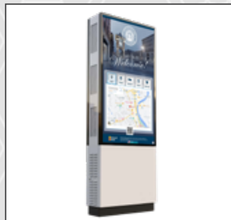
Outdoor Monolith Kiosk $37,000.00