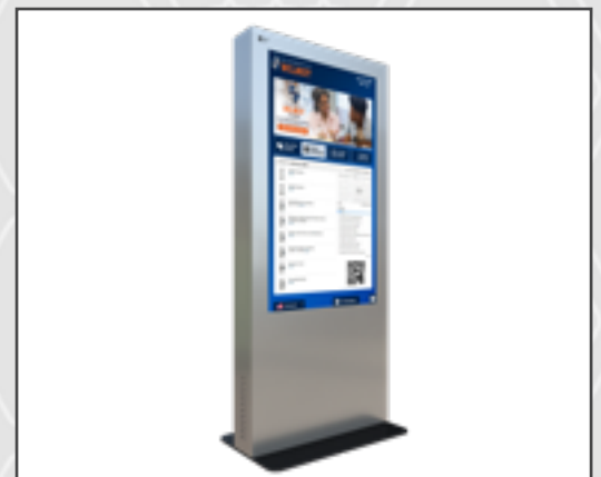
Monolith Kiosk $21,500.00