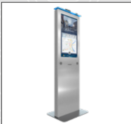
Merchant Max Kiosk $14,990.00

Estimate cost based on a quantity of 2 units