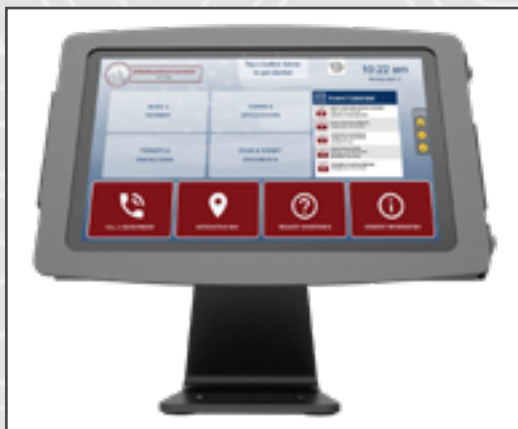
Office Extension Lite $4,500.00

Estimate cost based on a quantity of 2 units