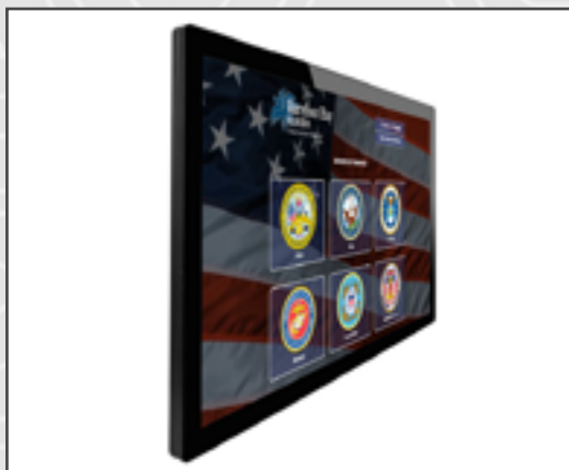
Wall Mounted Kiosk $10,116.00

Estimate cost based on a quantity of 2 units