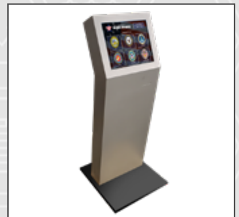
Enviro Outdoor Kiosk $17,542.00