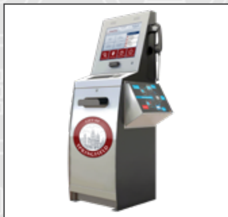
Office Extension Kiosk $11,600.00