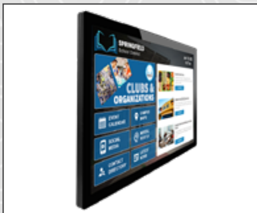
Wall Mounted Kiosk $11,479.00

Estimate cost based on a quantity of 2 units