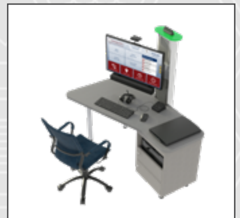
Office Extension Desk $16,500.00