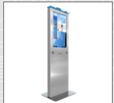
Merchant Max Kiosk $14,290.00