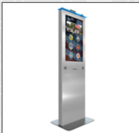
Merchant Max Kiosk $12,442.00