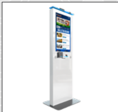
Merchant Max Kiosk $14,990.00