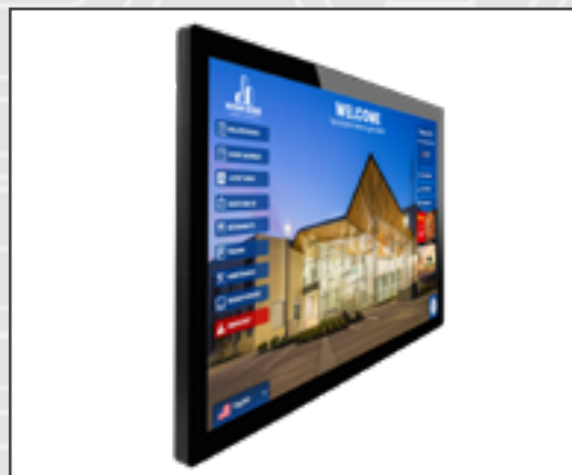
Wall Mounted Kiosk $11,479.00