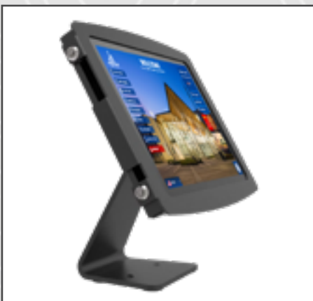
Countertop Tablet Kiosk $8,655.00

Estimate cost based on a quantity of 2 units